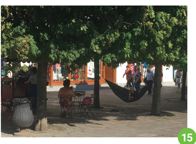
Picture 14: Well-maintained, safe and clean public spaces. Picture 15: Relaxed and welcoming atmosphere in Košice.