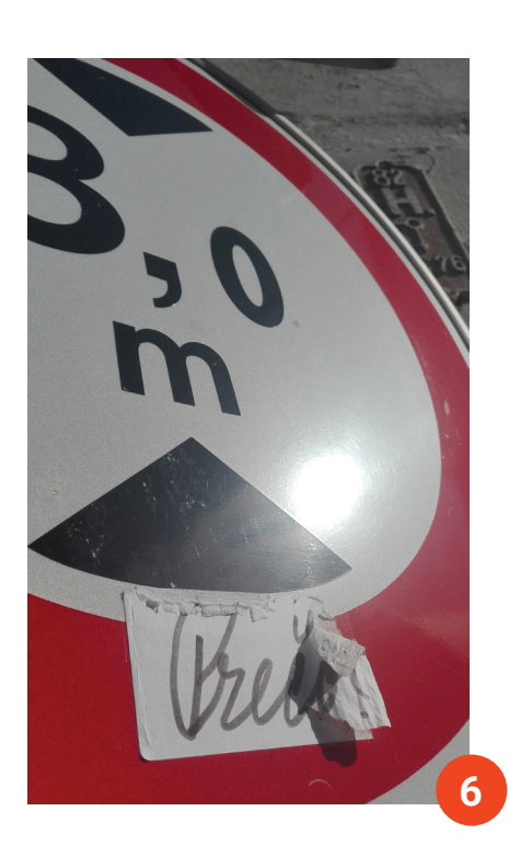
Picture 4: In front of the one of several City information tourist centres on Hlavna street. Author: Ivan Shepa Picture 5: City information tourist centres offer many information materials about Košice and the region (maps, culture offer, and sightseeing brochures) in different European languages. Author: Barbora Messova Picture 6: Somebody (refugees, migrants) coming from abroad might ask "Why"= Prečo? "Why there is no place where I can ask about school for me?". Author: Barbora Messova