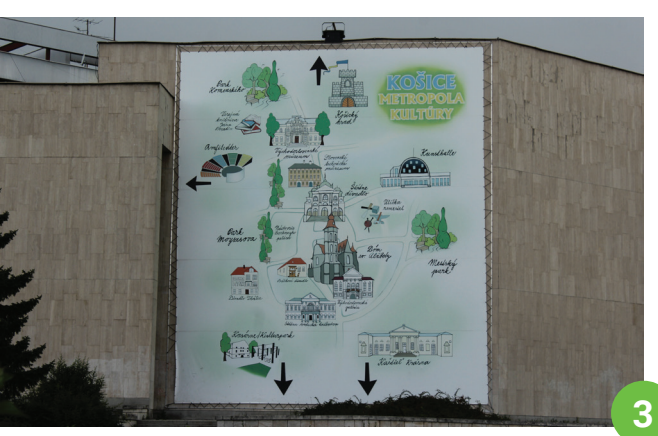
Picture 2: Municipality Office: Big board on the walls of Košice Town Hall introducing Košice as a city of culture. Picture 3: Inside the reception hall there are beautiful pictures introducing famous people of Košice – art work made by children. There is a feeling that the city wants to interact with its citizens and takes care of the public premises.