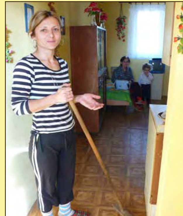
Po úspešnom sporení sa mohla klientka s tromi deťmi a mamou po piatich rokoch strávených v Avii presťahovať do nového nájomného bytu v Moldave nad Bodvou.